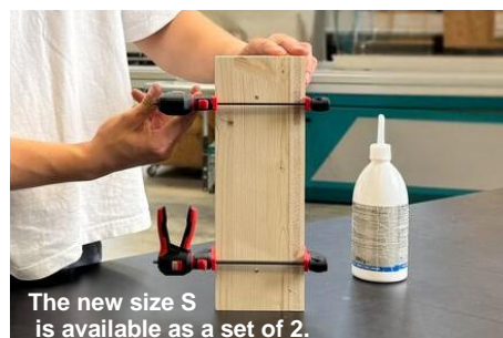
The new size S is available as a set of 2.