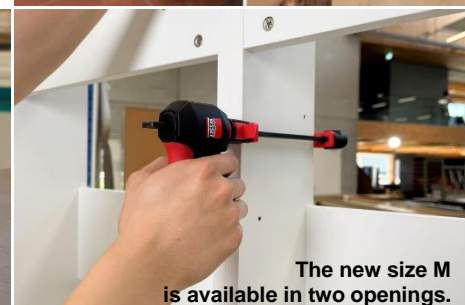
The new size M is available in two openings.