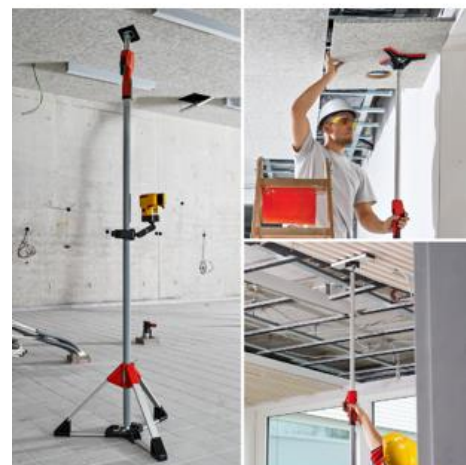
The current range of accessories expands the possible applications of the STE supports.