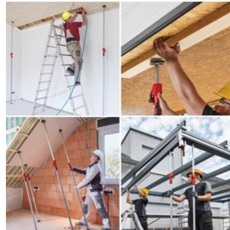
The STE supports with integrated pump handle are versatile.

Whether in kitchen and shop fitting, for positioning wall units or in drywall construction for securing building materials at great heights, the six sizes of telescopic drywall supports STE stand for high load capacity and convenient one-handed operation. With a maximum load limit of 350 kg when the telescopic rod is retracted – and even when fully extended in the two shortest versions – these supports are the most powerful on the market. In addition, the four longest models are GS-certified, offering tested safety. Their integrated 2-component plastic handle with pump mechanism and quick-slide button enables convenient one-handed operation in three steps: pull out the inner tube, pump until the pressure plate is in contact and turn clockwise to achieve the holding force on the handle. This makes work quick, safe and efficient.